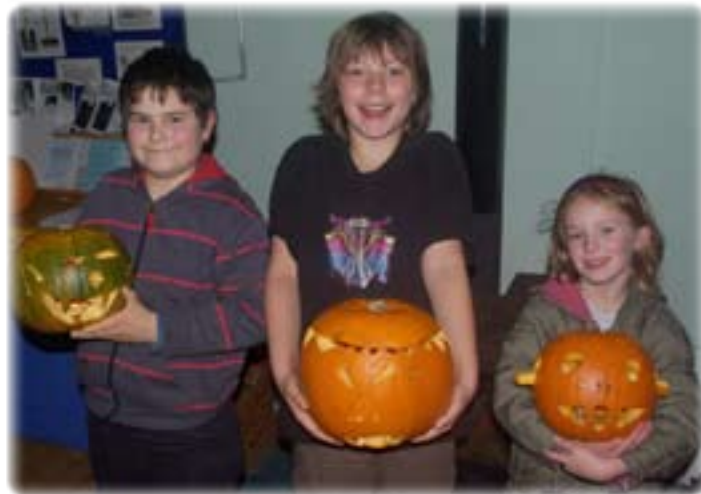
Pumpkin Evening: Winners of the 8-16 category of the pumpkin carving competition.

The competition is open to all children in the York area. The competition will be judged in two age groups: under 8 years and 8-16 years, one winner will be chosen from each group. Winners will win gift vouchers worth £20 and the winning designs will be made into large posters and displayed across the city as part of the York Rotters Christmas compost campaign. All entries should be on A4 paper and received by Friday 28th November .