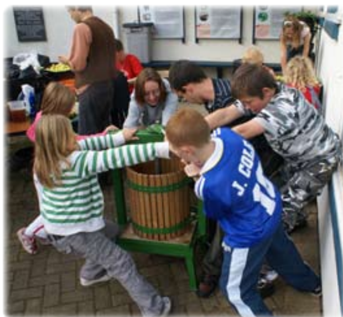
Apple Day 10th October: The apple press was busy all afternoon producing many litres of yummy juice.